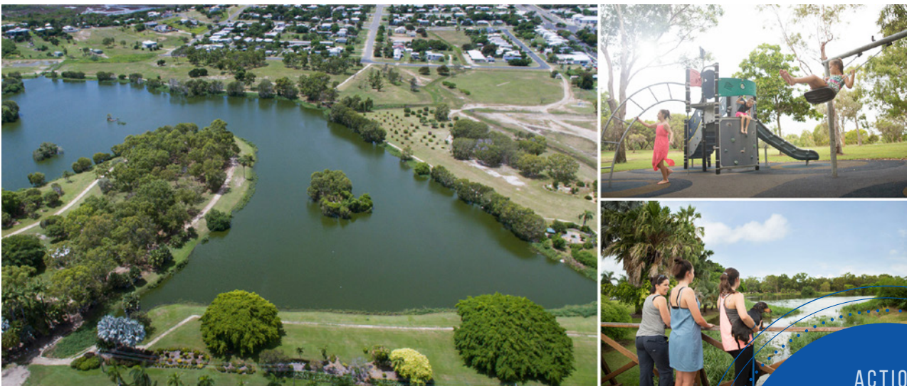
Figure 5: Mullers Lagoon, Bowen.

PROJECT CHAMPION: Infrastructure Services