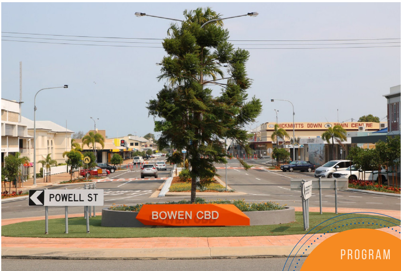
Figure 2: Façade improvement strategy on offer in Bowen CBD.