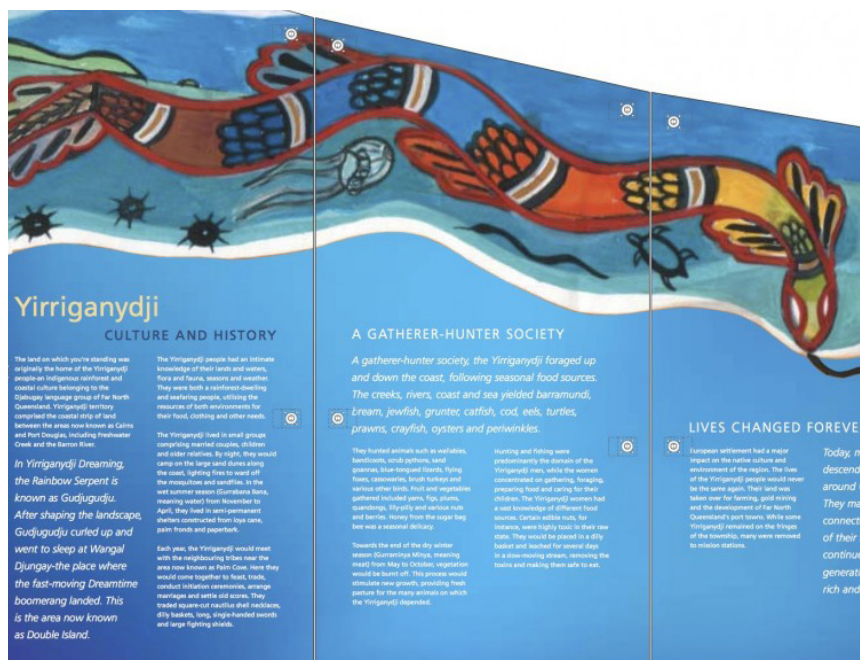
Figure 7: Example of interpretive signage, from Cairns Foreshore.

Stage 2 of the project will be the construction of the signage, subject to outcomes of Stage 1 and funding availability.