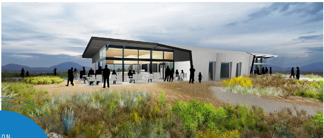
Figure 4: Proposed Flagstaff Hill Multi-purpose Centre concept design.

EST. COST (Grant/Council $): $4,000,000 STATUS: Near completion PROJECT CHAMPION: Infrastructure Services