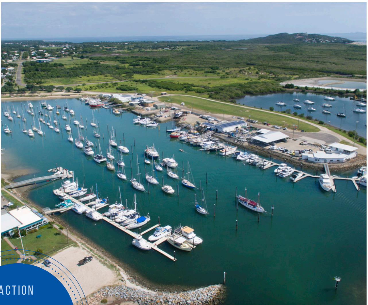
Figure 1: Bowen Marina