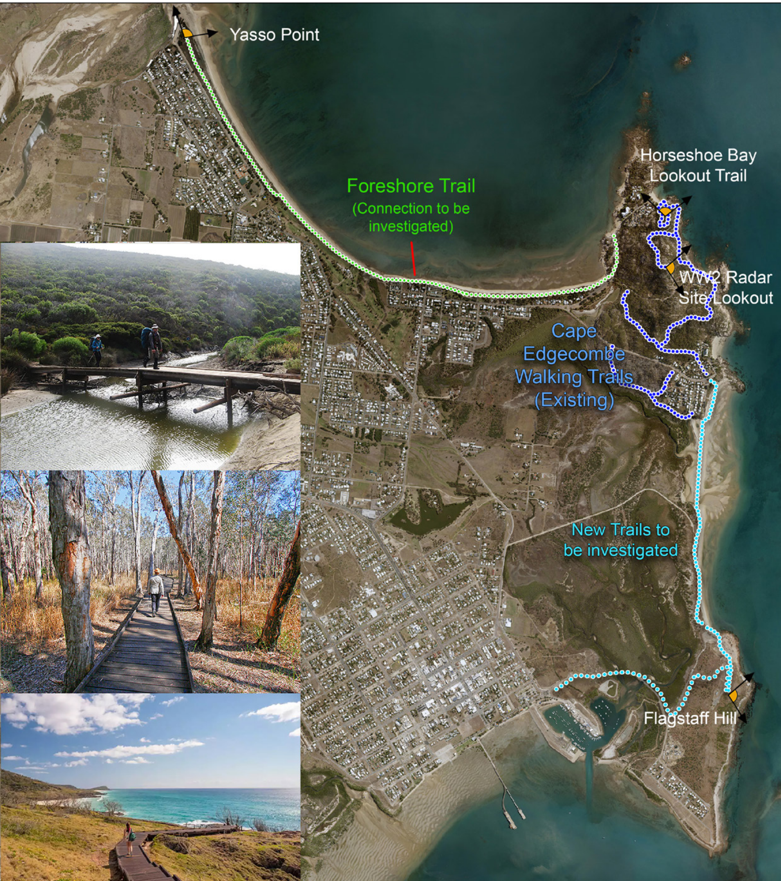
Figure 8: Bowen trails investigation.