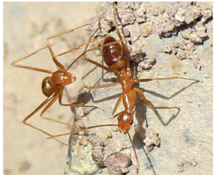
Yellow crazy ants

This fact sheet is developed with funding support from the Land Protection Fund.