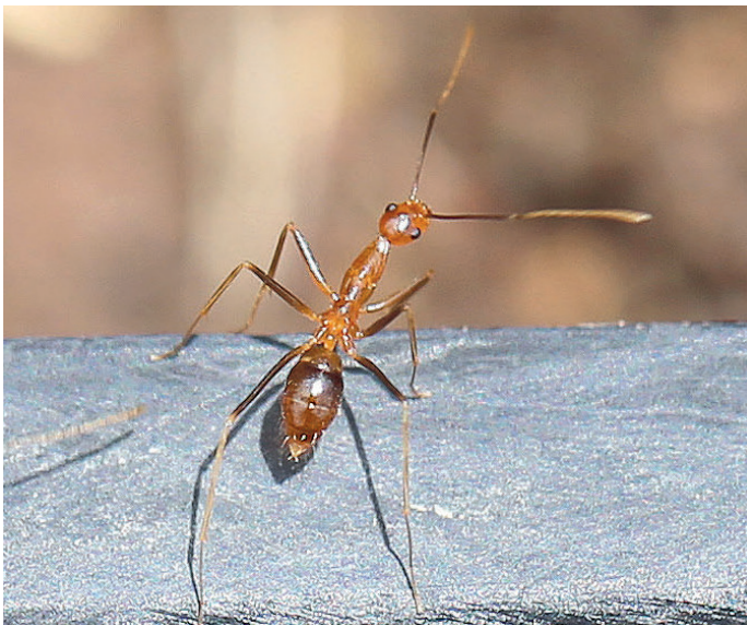
Yellow crazy ant