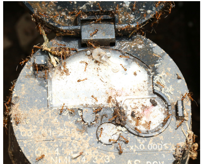
Yellow crazy ants can be found on metres