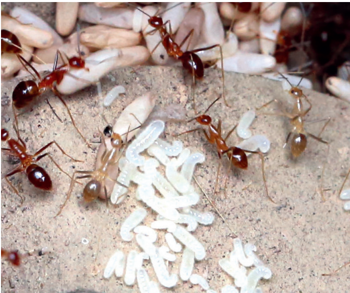
Yellow crazy ants pupa