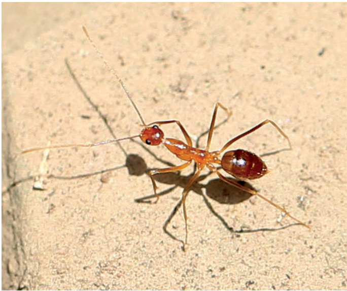
Yellow crazy ant