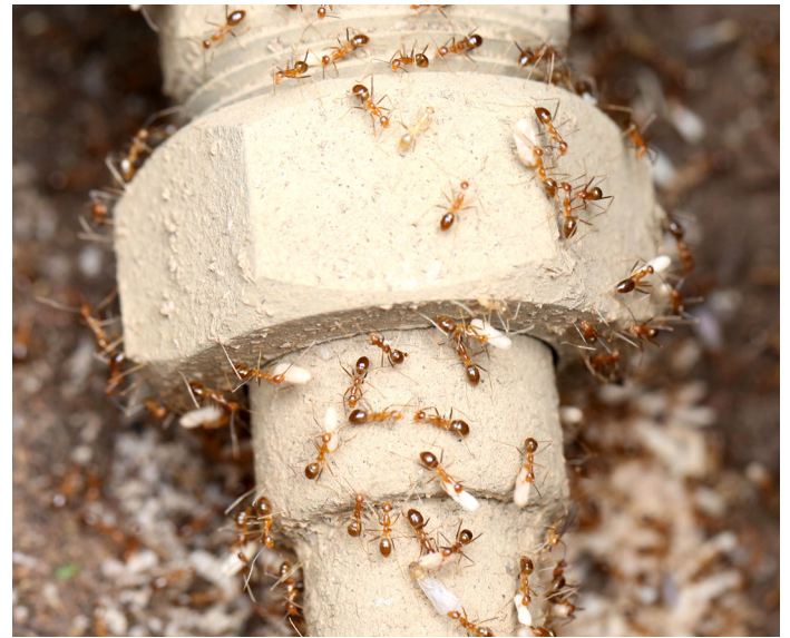
Yellow crazy ants smothering pipe